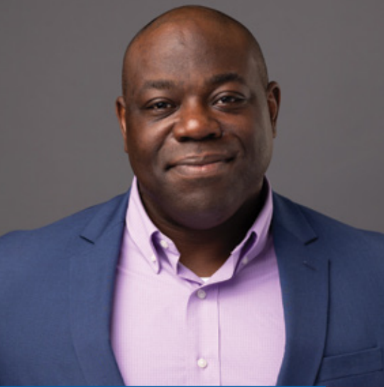
DWAYNE WATERMAN, Ward 3 and Mayor Pro-Tem